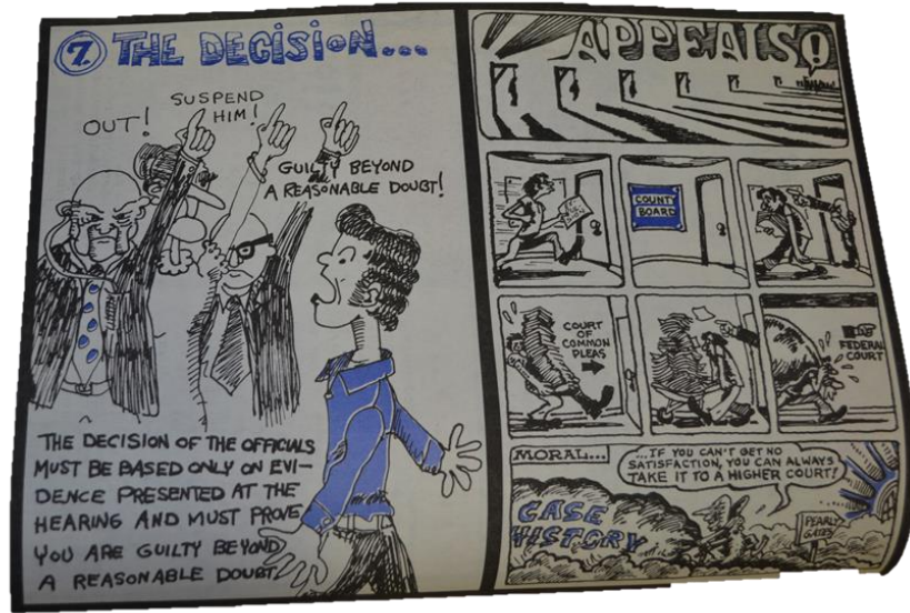
Figure 1.3 Illustration from South Carolina Handbook of Student Rights and Responsibilities

In 1975, the United States Supreme Court for the first time considered the issues arising from student discipline procedures in public schools. In Goss v. Lopez , the Court ruled that the suspensions of nine black students in Columbus, Ohio, who had been suspended for 10 days from their schools in 1971, were unconstitutional because students did not receive due process. Administrators suspended students following widespread racial tension and unrest due to the cancellation of Black History Week by school administrators, but some of the suspended students maintained they were only bystanders to demonstrations, and had done nothing wrong. At the time, the state of Ohio permitted 10 day suspensions and required no hearing procedures. By a 5-4 decision, the Court ruled that students were entitled to due process rights, even in cases of short suspensions. At the very minimum, the court said, a student "must be given some kind of notice and