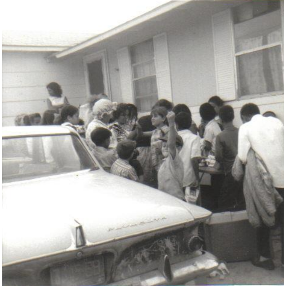
Figure 2.1 Four Holes School Children Gathered in the Four Holes Community