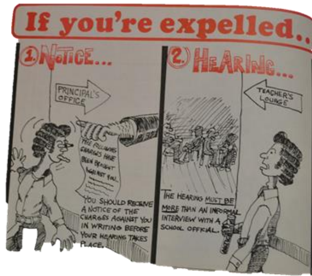
Figure 1.1 Illustration from South Carolina Handbook of Student Rights and Responsibilities

and numbers for students to call if they needed help in disciplinary procedures. Civil rights groups around the nation applauded the South Carolina student handbook and many asked Mizell to assist in creating handbooks in their own respective states. cx