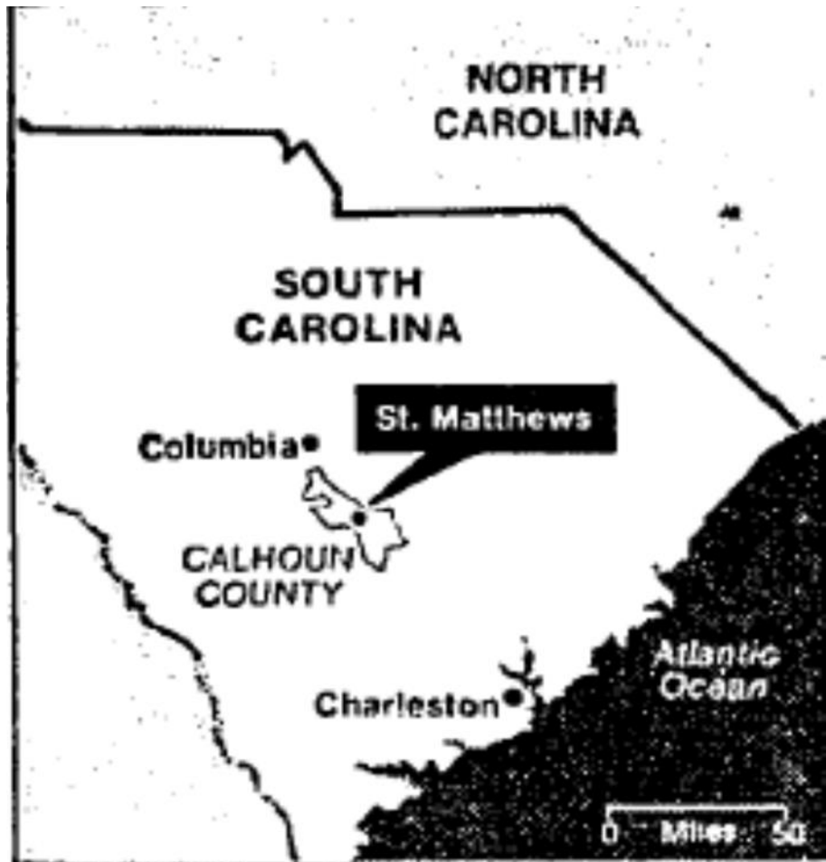
Figure 5.1 Map of Calhoun County

opportunities. As one young participant said, “Black folks got white folks all shaken up now. We can do this thing. All we got to do is stick together.” cdlviii