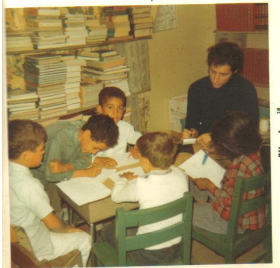
Figure 2.5 Four Holes Freedom School