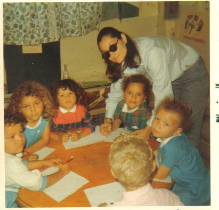
Figure 2.4 Young Four Holes Students at Freedom School