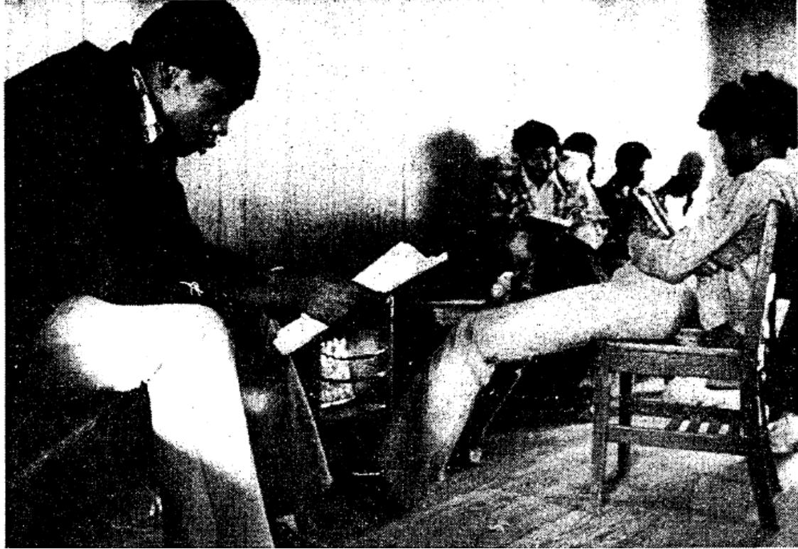
Figure 5.2 Picture of students studying at an abandoned Masonic Lodge in Calhoun County during the boycott.