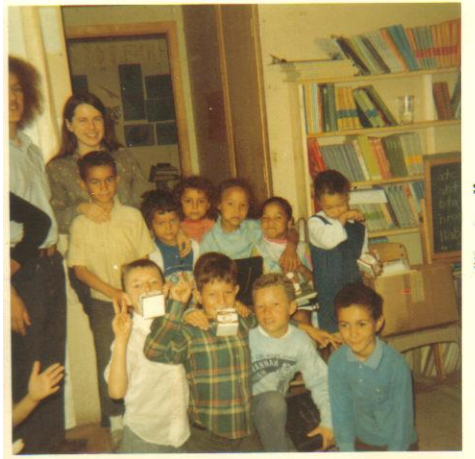
Figure 2.2 Four Holes Students Gathered at Freedom School

field experience. Volunteer students from the University of South Carolina also provided medical and dental care to many of the malnourished children. ccxxvi