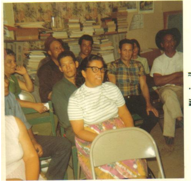
Figure 2.8 Meeting of parents and community leaders in Four Holes.

By the beginning of October, protestors in Ridgeville, which now included many USC students and South Carolina activists, frustrated with the lack of progress for Four Holes students, decided to take a more direct approach. Activists began gathering at the Four Holes School and then marching the three miles to Ridgeville Elementary School. After the third march on the school, sheriff's deputies stopped protestors almost as soon as they started, keeping them from entering Ridgeville. In early October, protestors decided they needed to take more vigorous action, and marched on the streets, entering school and city property. Authorities arrested all protestors. Coincidentally, NBC news reporters, who were in town to do a story on the Ridgeville boycott, caught the protest and arrest on camera. Reporters interviewed Reynolds and the story aired on the Huntley-Brinkley nightly news on October 3. ccxxvii Most of the arrested activists refused to pay their bail and spent several nights in jail. ccxxviii