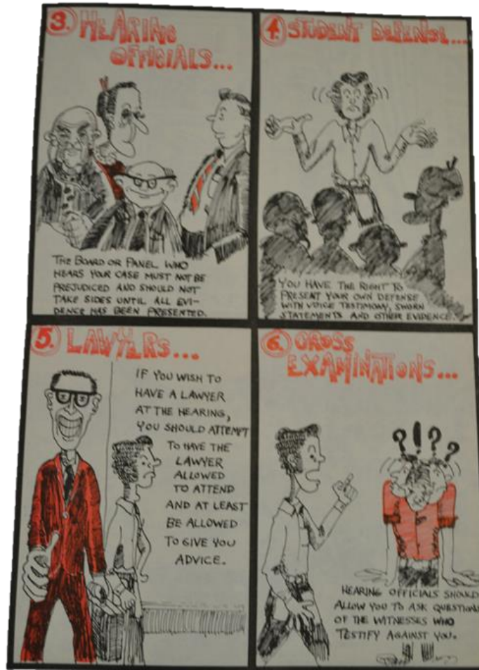
Figure 1.2 Illustration from South Carolina Handbook of Student Rights and Responsibilities