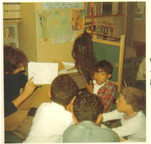
Figure 2.3 Students Learn at Four Holes Freedom School