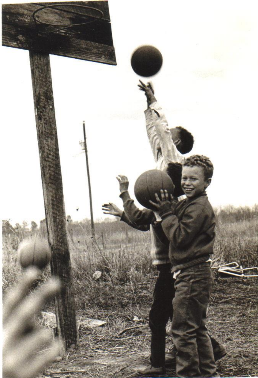
Figure 2.7 Four Holes Student Play Basketball in Four Holes Community