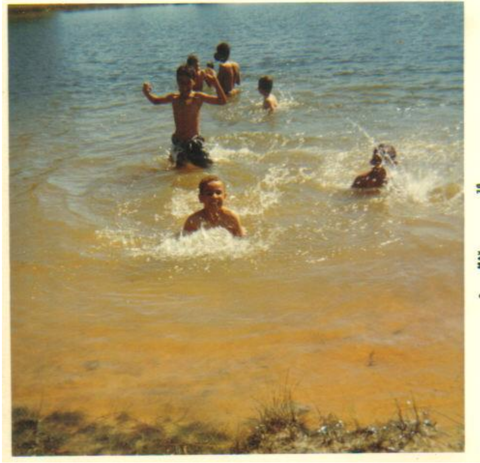
Figure 2.6 Four Holes Children Swim in Nearby Four Holes Lake